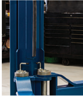
First in class door protector and a powerful, yet sleek arm design