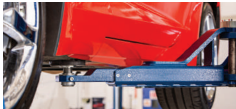
The low profile carrying arms allow you to pick up a wide range of lowered chassis.