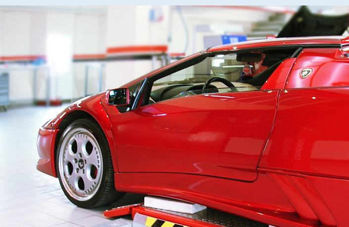
Very low construction: Perfect for sports cars