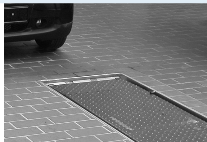
In-ground or above ground installation