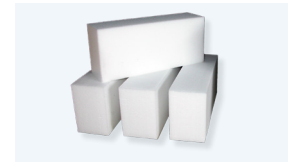
Crush blocks 4"x6"x13" (included)