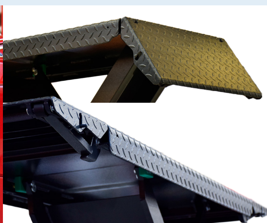
Adjustable ramps with flaps: Easy to lock and unlock with one hand