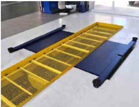
No obstructions, clear floor