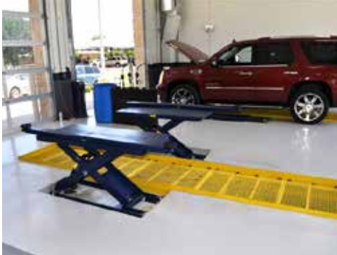
Quick Lube NT (optional flush mount shown)

Designed for quick lube and wheel service using subfloor pits, the Quick Lube NT mid-rise lift has great flexibility for almost any application. The Nussbaum NT cylinder system allows the lift to be mounted at any width with no need for mechanical ties between platforms, eliminating obstructions in the pit.