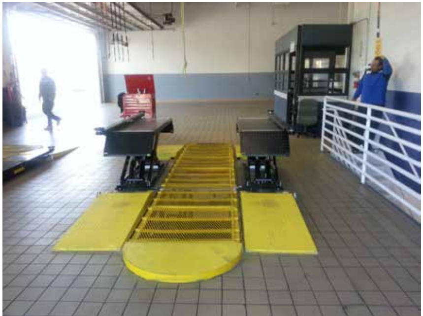
Quick Lube NT standard unit surface mounts with drive on/off ramps

Even the lowest of cars can access the lift due to the low 4.625" platform height. The easily adjustable outboard swing arms, that include height extensions, allow for lifting of vehicles whose frame falls inside the platform area. The standard unit surface mounts with drive on/off ramps. The flush mount unit (shown below) eliminates all transitions on and off the lift.