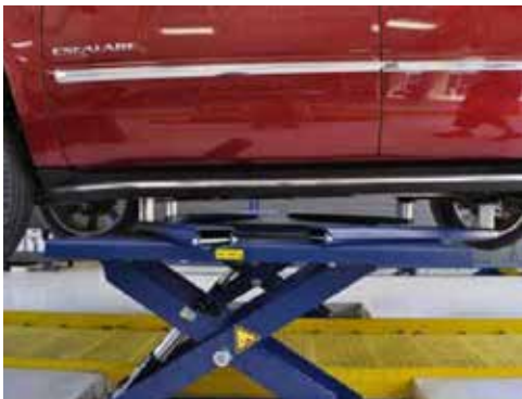
Using swing arms to lift SUV on frame