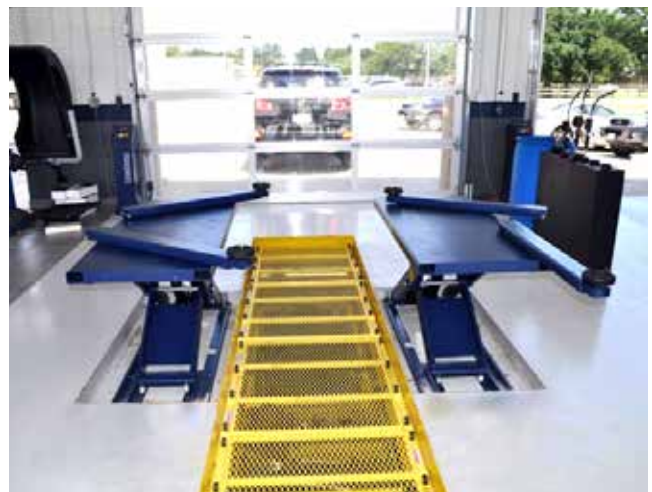
Quick Lube NT has no mechanical ties between platforms eliminating work obstructions