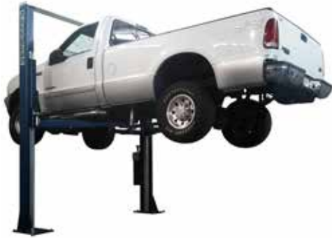
HF 11000 with symmetric double jointed carrying arms is perfect for vans, trucks, SUV and passenger cars

The HF 11000 lift is a revolutionary hydraulic two post lift. The patented HyperFlow® technology allows the lift to be perfectly and automatically synchronized without cables or pulleys. The hard piping guarantees a long lasting and secure operation. Increasing the productivity and efficiency of the workshop while reducing cost of ownership.