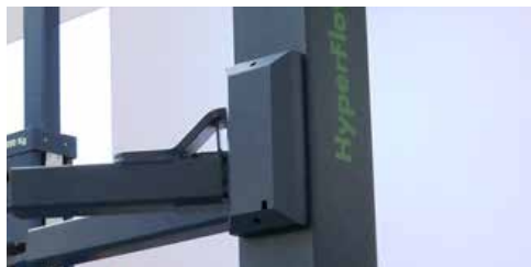
Steel tubing and mechanical locking system ensure safe operation at any height