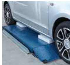
High Density Polymer Pads