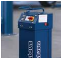
Push Button Controls