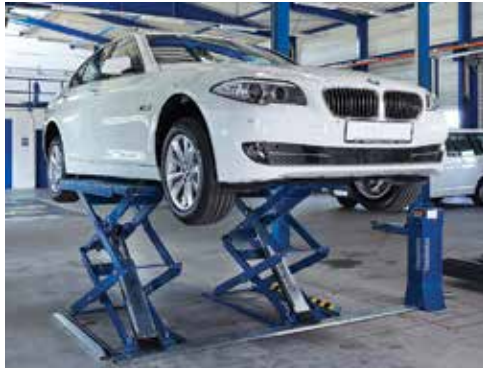
JUMBO – easy to use extending platforms lift a wide range of vehicles

JUMBO is a double-scissor lift with optional lifting capacities of 7,000, 8,000 & 9,000 pounds. It is the perfect lift for car inspection, tire service, fast repair, dealerships and service centers. It allows workshops to increase productivity through improved utilization of space. From a business performance perspective, the JUMBO LIFT is the most cost effective solution on the market.