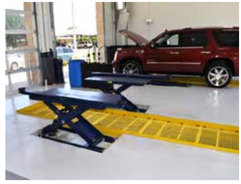
Quick Lube NT (optional flush mount shown)

Designed for quick lube and wheel service using subfloor pits, the Quick Lube NT mid-rise lift has great flexibility for almost any application. The Nussbaum NT cylinder system allows the lift to be mounted at any width with no need for mechanical ties between platforms, eliminating obstructions in the pit.