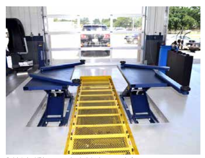
Quick Lube NT has no mechanical ties between platforms eliminating work obstructions