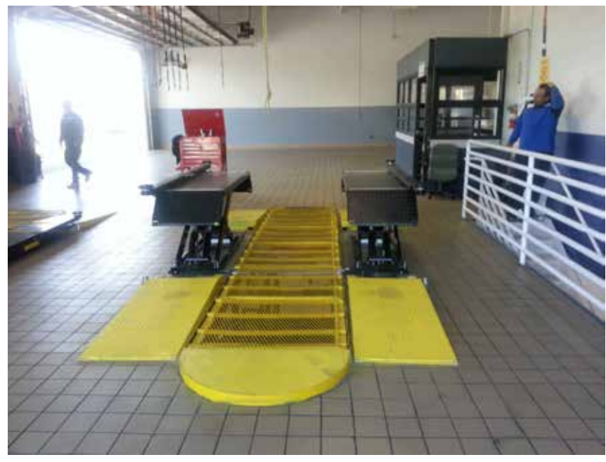
Quick Lube NT standard unit surface mounts with drive on/off ramps

Even the lowest of cars can access the lift due to the low 4.625 "platform height. The easily adjustable outboard swing arms, that include height extensions, allow for lifting of vehicles whose frame falls inside the platform area. The standard unit surface mounts with drive on/off ramps. The flush mount unit (shown below) eliminates