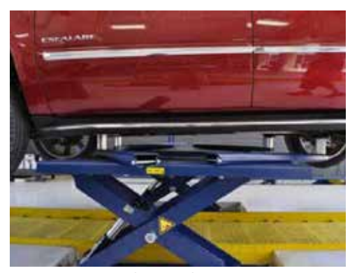
Using swing arms to lift SUV on frame